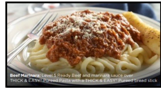
Beef Marinara: Level 5 Ready Beef and marinara sauce over THICK & EASY® Pureed Pasta with a THICK & EASY® Pureed bread stick

Creating Level 5 meals, with the right consistency, just got much simpler. And safer.