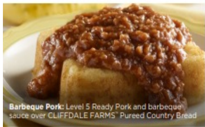
Barbeque Pork: Level 5 Ready Pork and barbeque sauce over CLIFFDALE FARMS® Pureed Country Bread